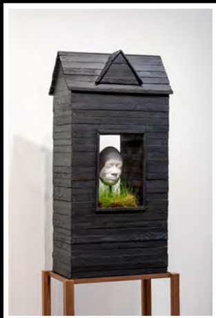
Kenn Hetzel: "Haunted Thought/Inner Peace" Charred wood, grass, cast face